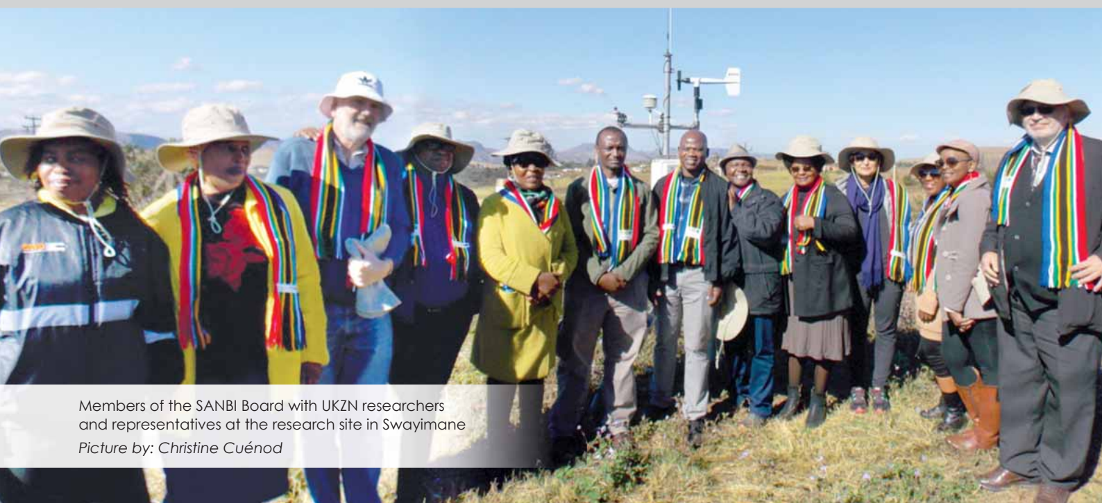
Members of the SANBI Board with UKZN researchers and representatives at the research site in Swayimane